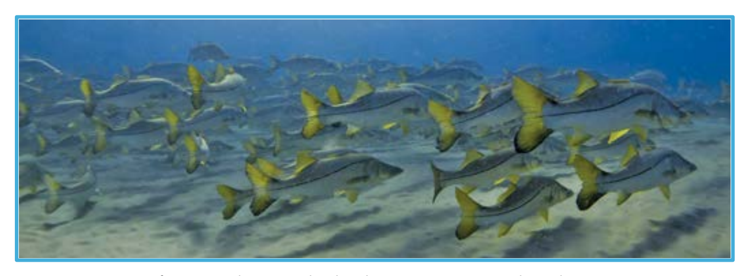
A spawning aggregation of common snook swims into the tide as they prepare to spawn in an Atlantic inlet.

Until recently, it was thought that all female snook return to the same spawning aggregation sites every year. But recent studies show that in fact they are "skip spawners." Some females spend years far up rivers and springs without spawning. The assumption is that some of the female population is left behind during spawning, in case a devastating event such as a red tide happens suddenly enough to wipe large percentages of spawning fish. It would make no sense for all of the sexually mature females to put themselves in a place where predators or harmful algae blooms could wipe them all out at once.