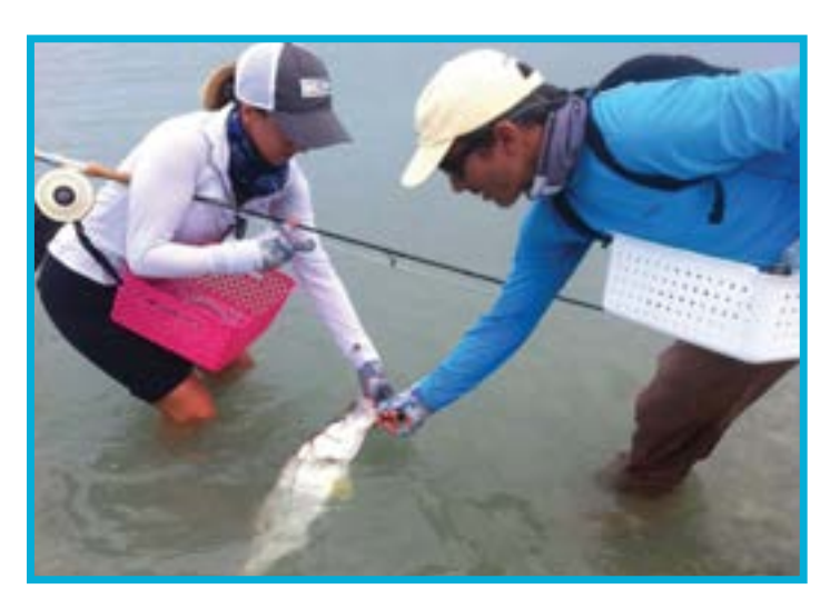
Fishing is a cherished form of recreation for couples and families. Here a couple of fly angler release a snook. They want to ensure the opportunity for future generations of anglers.

In terms of harvest, Florida and Texas manage snook with size limits, bag limits, and closed seasons. Florida keeps the fishery closed to all but catch-and-release fishing during December and January, when this tropical species is vulnerable to cold snaps, and June through August – the peak of the spawning season.