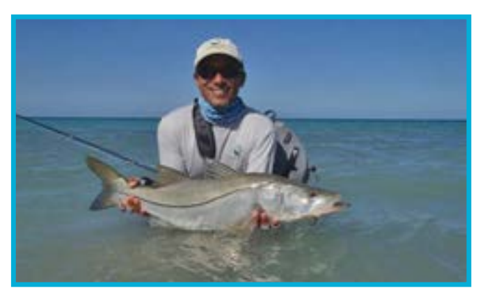
Big female snook often carry eggs that may be crushed if the fish is held out of the water for too long. It's best to leave at least the belly in the water for photos, and to take photos quickly in order to let the fish breathe properly in the water.

Snook are voracious. Though they depend less on crustaceans as they mature, snook feed on shrimp, crabs and other invertebrates throughout their lives. Three of the most