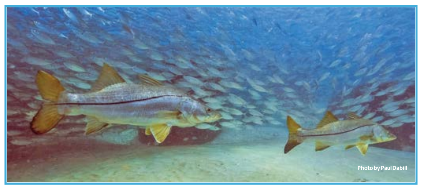
Snook feed on a wide variety of forage fish. In order to achieve relative safety in numbers, forage fish "school up" in large groups that may include several species that look like each other. Here, a school of forage fish pass over prowling snook.

lobally, fishermen target 12 species of snook, ( Centropomidae spp. ). These species primarily live in the warmer waters of the western Atlantic, including Florida's Atlantic Coast; the southern latitudes of the Gulf of Mexico; Cuba; the western Caribbean; and in the eastern Pacific. In the United States, several of these tropical and sub-tropical species occur only in Florida and Texas, where they are managed as recreational fisheries, with limits concerning which fish an angler can keep, and when. Elsewhere, combinations of tourists and other recreational anglers, subsistence fishermen, and commercial fishermen compete for the species, which provide great sport and boast firm and flaky white filets. The roe of females is also a fried delicacy.